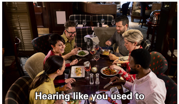
Hearing like you used to

Traditional Hearing Aids. This technology has been available for 40+ years and works on the premise of making (all) sounds louder. Although this technology uses 'tricks' to reduce background noise (i.e., turning off certain microphones or boosting certain sounds), it does not have the ability to adapt to different listening environments or provide enhanced clarity of speech sounds.